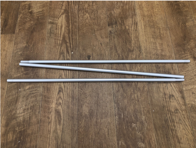
Center Vertical Pole Assembly. 3 pieces elastic corded together