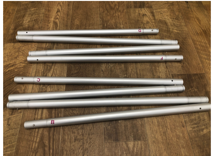
Top & Bottom Pole Assemblies. each 4 pieces elastic corded together)