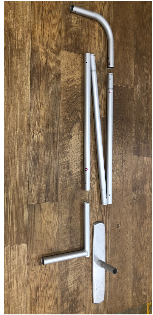
Right Side Pieces. 1ea top curved E/F, 1ea bottom L shaped D/C, and 3 piece vertical elastic corded together E/D, 1ea Base Assembly