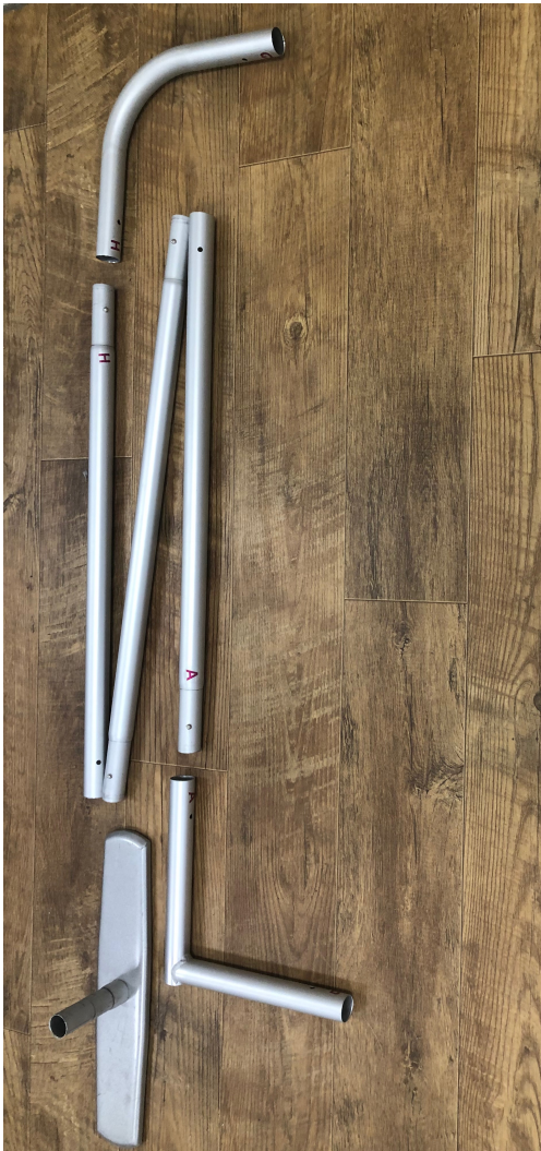
Left Side Pieces. 1ea top curved G/H, 1ea bottom L shaped A/B, and 3 piece vertical elastic corded together H/A, 1ea Base Assembly