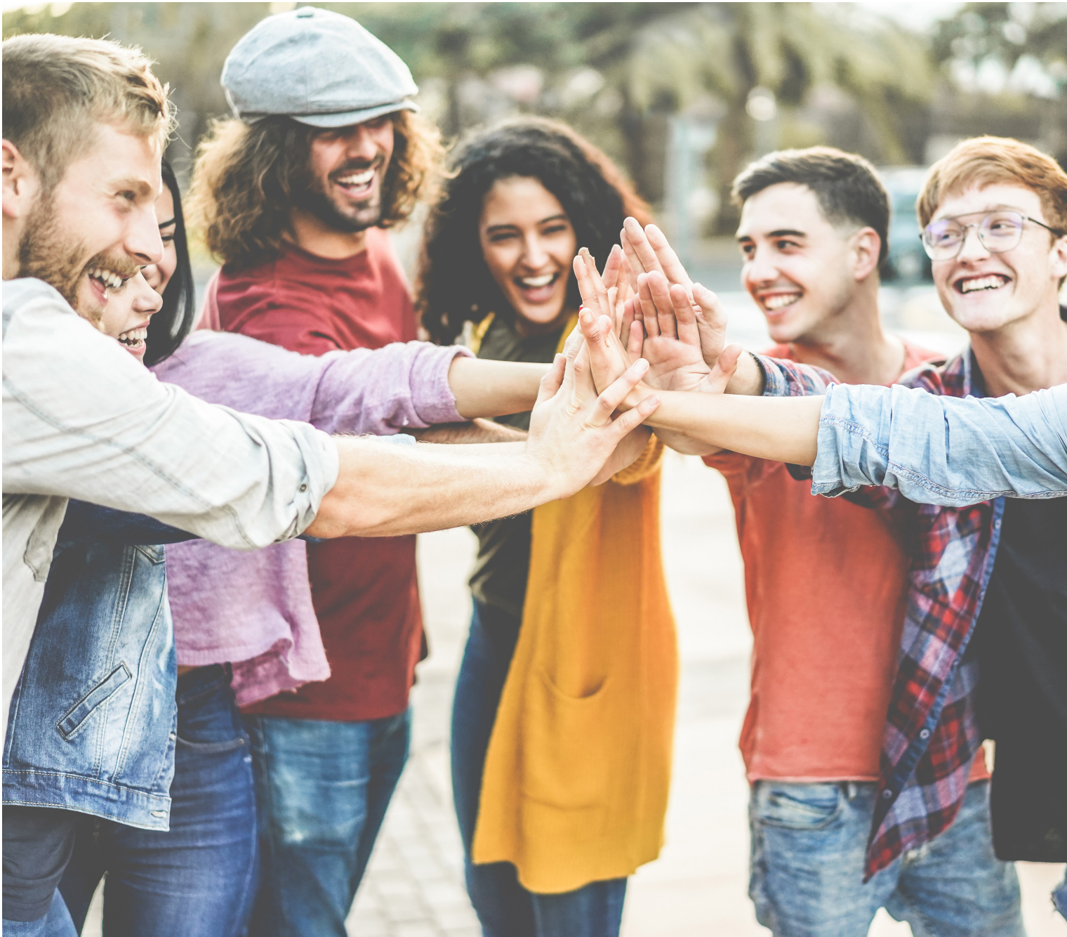
Version: 20210427_01 | All | Small Group Guide

ALL.AMERICA PO Box 838 Grandview • MO • 64030 info@allamerica.org