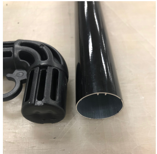
Guides & Channels

Teeth inside tubes must slide into slots in joining pieces.