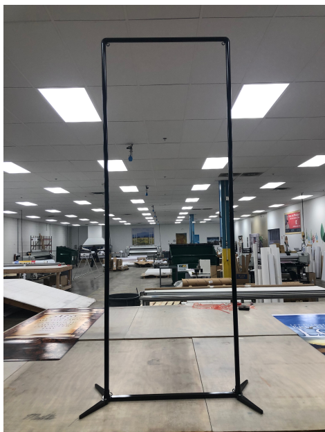
Fully assembled frame