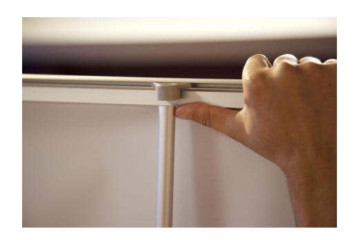
STEP 4: Standing behind the banner, gently pull the banner up out of the canister and insert the poles into the sockets on the silver bar at the top of the banner.