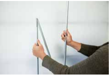
STEP 2: Unfold the three tubes of the shock-corded pole inserting them together so they form one long pole. Repeat for second pole.