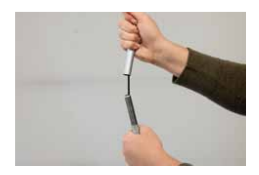
STEP 3: Pull apart and fold the shock-corded poles. Return all parts to storage case.