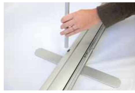
STEP 3: Place either end of the poles into the circular supports on the back side of the Roll-Up canister.