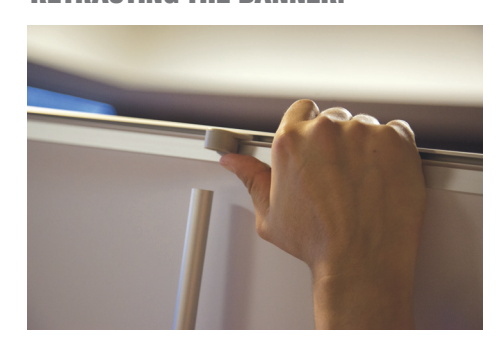
Holding the cross bar at the top of the banner and the poles, lift it off of the support poles.