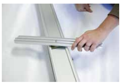
STEP 1: Pivot the attached feet so that they are perpendicular to the roll-up canister.